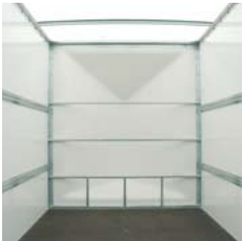
Load lock tracking