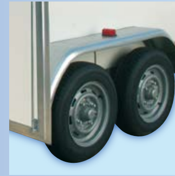
Galvanised steel mudguards