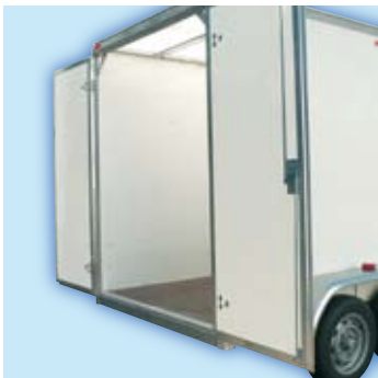
Double rear opening doors (5')