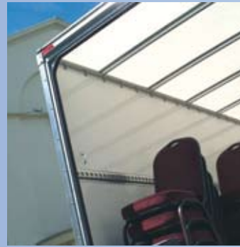
Translucent fibreglass roof

Made for hard work, Tow-A-Vans come with these solidly superb features