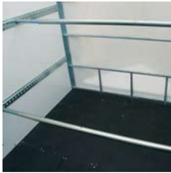
Tracking for shoring poles