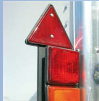
Rubber mounted lights