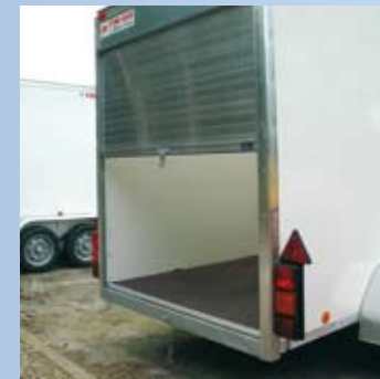
Roller shutter rear door