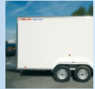
GRP faced plywood sides